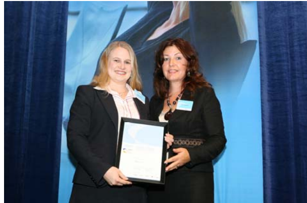
Receiving my Finalist Certificate

Hitting the halfway mark in my Scholarship journey has been exciting because I have been able to reflect on the knowledge and skills that I have developed in the last six months. Now I really look forward to the next six months to work on my goals and keep lifting to the next level in my business!